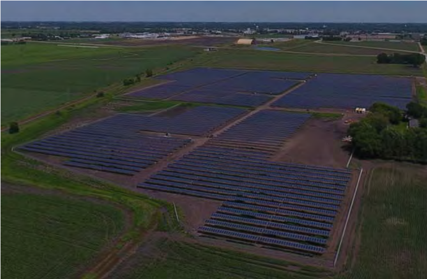
Southern Minnesota Municipal Power Agency's 5 MW Lemond Solar Station Owatonna, MN