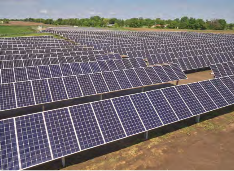
Minnesota Municipal Power Agency's 7 MW Buffalo Solar Buffalo, MN