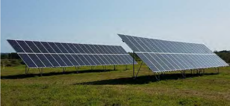
Detroit Lakes Public Utility's 29.3 kW Select Solar Community Solar Garden Detroit Lakes, MN