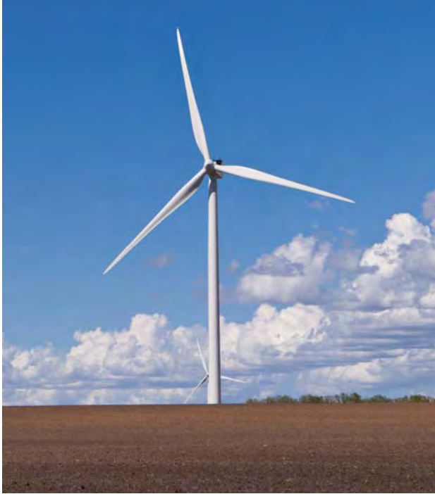
Minnesota Municipal Power Agency Oak Glen Wind Turbine Blooming Prairie, MN