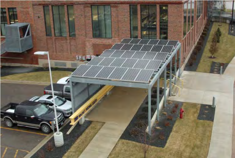
Owatonna Public Utility's 10 kW Demonstration Solar Owatonna, MN