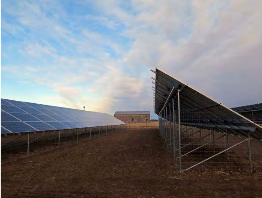
St. Cloud Utility's 220 kW Wastewater Solar Array St. Cloud, MN