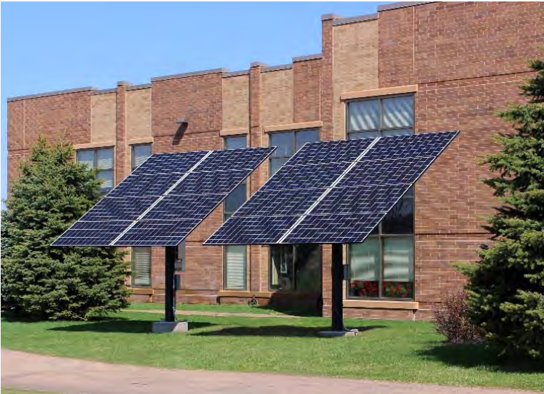
Minnesota Municipal Power Agency 5 kW Hometown Solar Shakopee, MN