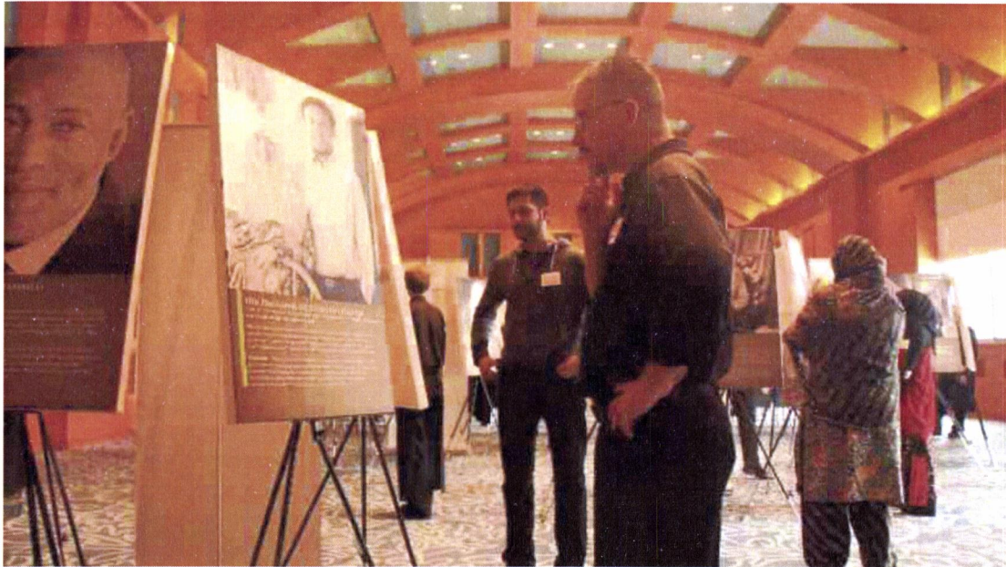
Exhibit preview at the Minneapolis Institute of Art was well attended and received rave reviews