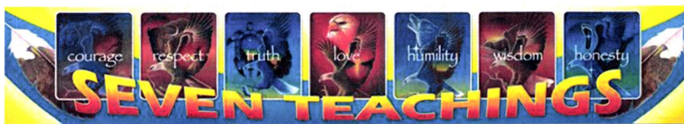
Image from Leech Lake Tribal College website http://www.lltc.edu/about/guiding-principles

Anishinaabe worldview includes the Seven Grandfather Teachings of Inendizowin (Humility), Zoongide'iwin (Courage), Manaaji'idiwin (Respect), Nibwaakaawin (Wisdom), Debwewin (Truth), Gwayakwaadiziwin (Honesty) and Zaagi'idiwin (Love). We took a deeper look at the teachings. Using the Fist-to-Five voting method, we adopted the Seven Grandfather Teachings as our principles.