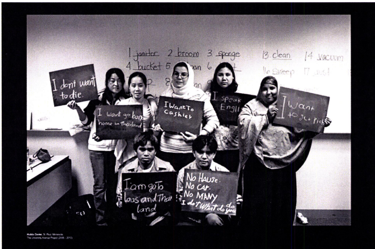
EXHIBIT: Identity and the American Landscape