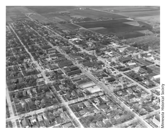
Taking a broad view helps identify linkages and potential ripple effects. Aerial view of Pipestone, Minnesota, 1954

Cooperation among local governments can benefit everyone by providing a formal mechanism for addressing shared problems that do not respect political borders, such as traffic, flooding, or water and air pollution. Multijurisdictional planning reflects the reality that the fate of one community is, in many ways, tied to the fate of those around it. It is a way to make sure that the many parts of an area pull together toward common ends and do not go in directions that are at odds. The unifying framework provided by the planning process can help prevent serious conflicts.