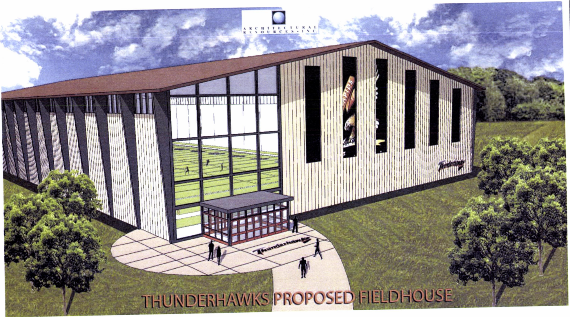
THUNDERHAWKS PROPOSED FIELDHOUSE