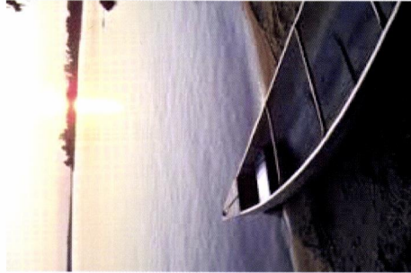
Woods, water, minerals all intertwined in the fabric called the IRON RANGE!

Ensuring the voices of our Range cities, townships and schools will be heard on the issues of economic enhancement and quality of life.