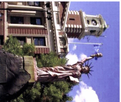
Hibbing City Hall

The main function of RAMS is to monitor proposed State and Federal legislation and determine how it may affect Association member units of government. RAMS works closely with the Iron Range Delegation, the Iron Range Resources and Rehabilitation Board (IRRRB), and area economic development entities to further community development and quality of life for all member units.