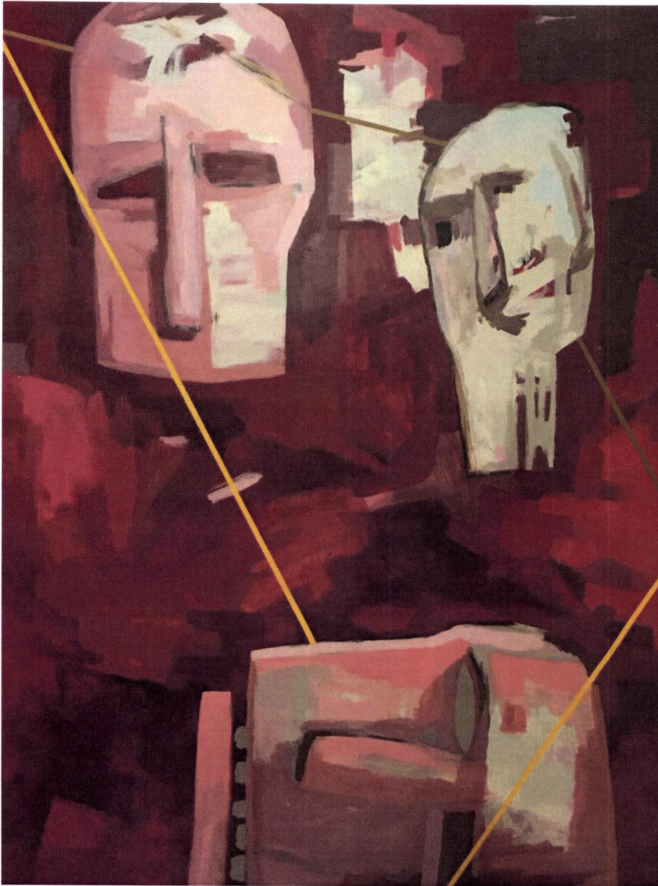
Aaron Olson-Reiners, "Selfobject #7," 2017 Acrylic on panel, 48 x 36 inches